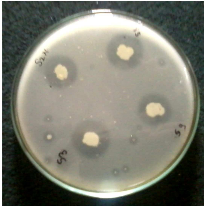
Fig. 3: Feather degradation of the chicken feathers by the Bacillus spp.